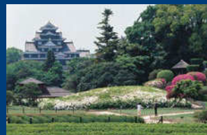
Okayama Castle, Okayama Korakuen